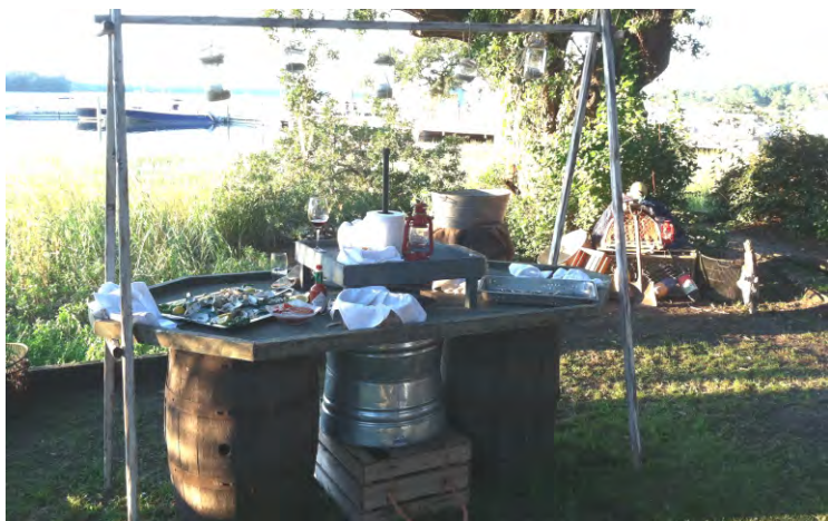
Oak Barrel Buffet: $250.00 complete