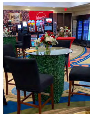
Topiary Cocktail Table & Glass Top: $150.00