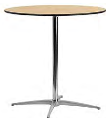
Cocktail Table: 30" Tall x 30" or 36" Diameter: $12.00