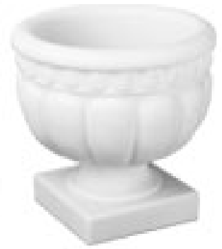
Light Weight Planter/Urn: $20.00