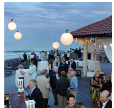
Illuminated Orb Lanterns: $15.00 - $20.00 ea., w/ Light Inside