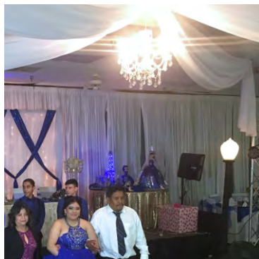
Small Crystal Chandelier: $150.00