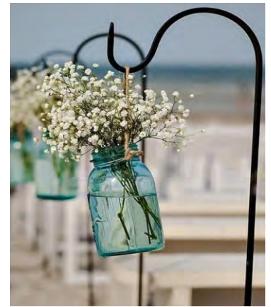
Shepherd's Hooks: $7.50 ea. (Floral Additional)