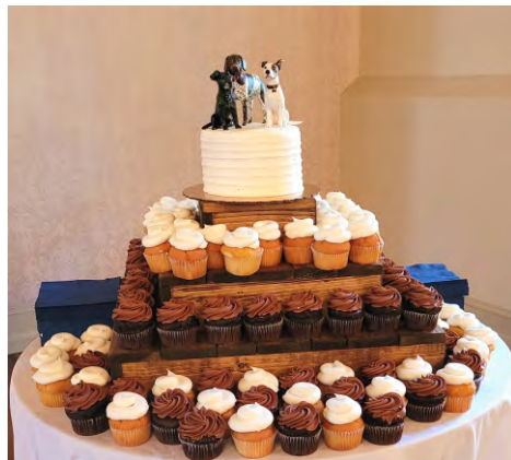
Three-tier, rustic crate cupcake stand (Top tier is 8" x 8"): $65.00 Pro tip: 2 tier cake on top 8x8 with a 4x4 cake and cupcakes below.