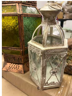
Ornate Silver Lantern: $5.00 ea.