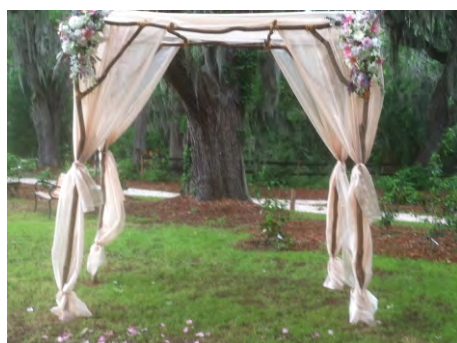
Natural Twig Arbor, Single: $450.00, plus $200.00 set up/$100.00 take down. Floral not included. With Fabric, add $75.00. Natural Twig Arbor, Double: $750.00. (Pictured above): Floral additional. With Fabric, add $150.00