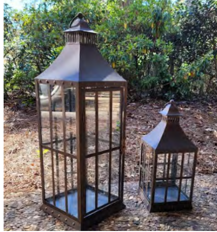
Dark Lantern, Small: $10.00/each (8 Available) | Dark Lantern, Large: $20.00/each (2 Available)