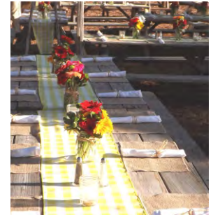
Vintage Mason Jars: $2-3.00 ea.