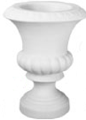
Light Weight Planter/Urn: $20.00