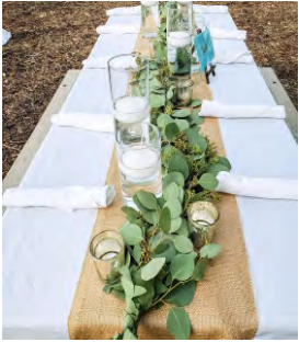
Floating Candles: $30.00 for set of 3