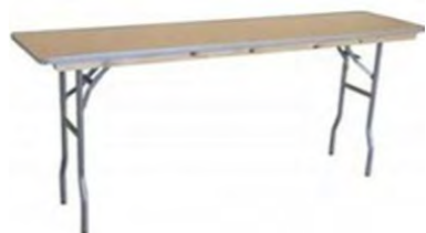
Conference Table: 8' x 18": $14.00