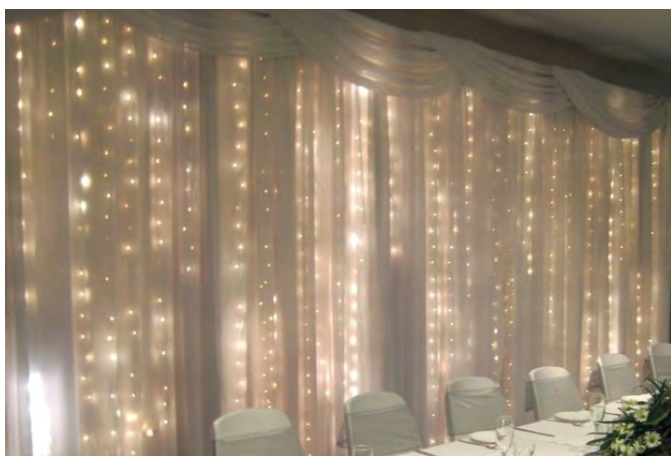
Ground-Supported Drapery: $10 running ft., plus labor (lighting additional)