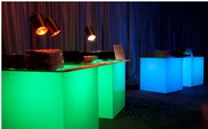
36" Illuminated Buffet Cubes, including LED lights: $200.00 ea.