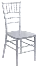
Chiavari Chair, Silver: $10.00 (+ $2.00 installation & dismantle)