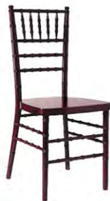
Chiavari Chair, Fruitwood: $10.00 (+ $2.00 installation & dismantle)