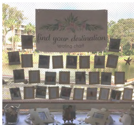
Custom Guest Seating Charts