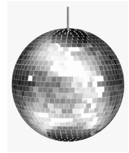
20" Mirror Ball + Rigging: $175.00 w/2 Pin Spot Lights: $20.00 ea., plus installation