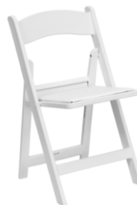
Padded Folding, White: $4.50 (+ $2.00 - bench additional)