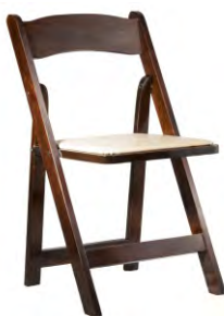
Padded Folding, Fruitwood/ Mahogany: $4.50 (+$2.00 installation)