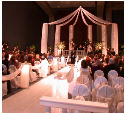
12' Illuminated Columns w/ LED Light: $200.00