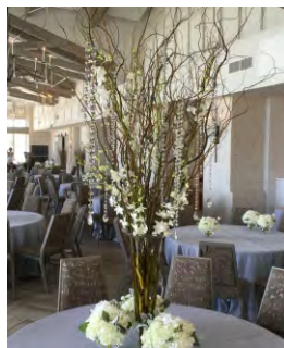
10" Glass Vase: $7.50 ea.