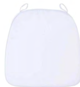
Chiavari Chair Cushion: $2.00