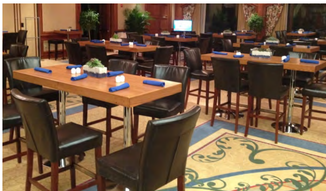
Backed Brown Leather w/ Dark Wood Legs Bar Stool: $50.00