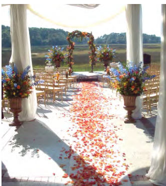
White 25' Aisle Runner: $200.00 (Special Order)