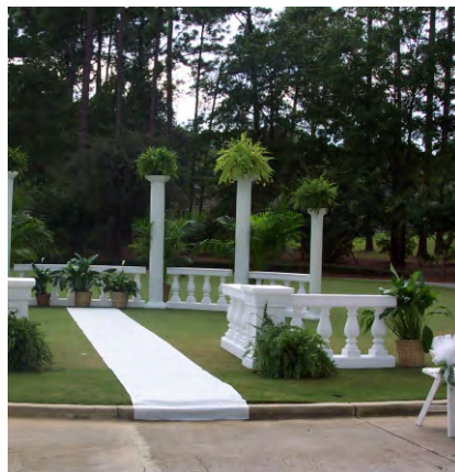
3' Balustrades: $35.00 ea.