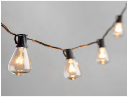
Edison Café Lights: $2.50/running ft.