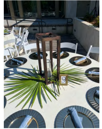
Open-Air Rustic Lantern