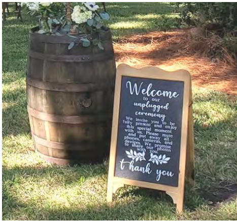
Custom Chalkboard Signage: $50.00