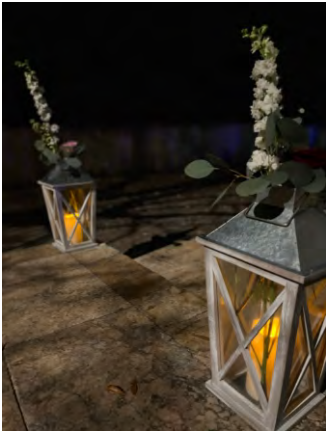
Tin Lantern: $12.00