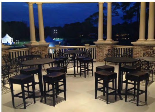
Saddleback w/Dark Wood Legs Bar Stool: $25.00