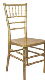
Chiavari Chair, Gold: $10.00 (+ $2.00 installation & dismantle)