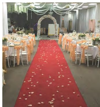
Red Carpet, 25' Aisle Runner: $75.00