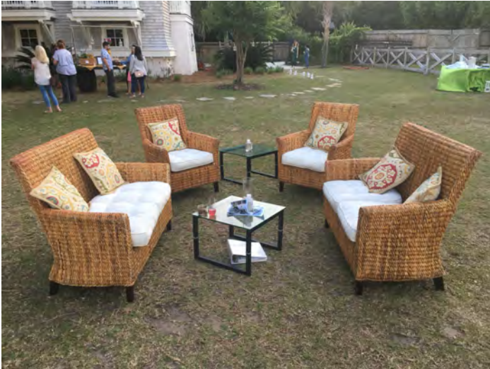
Honey Wicker Santee with Cream Cushion: $225.00