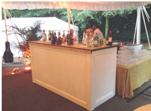
6' Cappuccino and White Bar Surround: $250.00