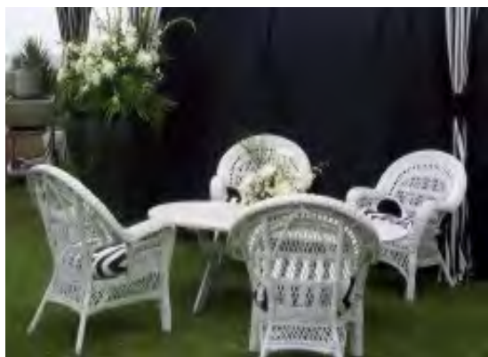
Wicker Chairs: $45.00