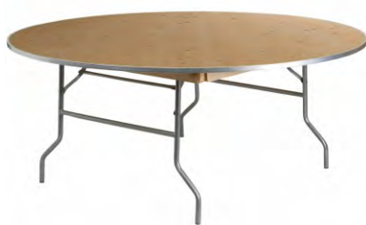
66" Round Banquet Table: $16.00