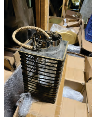
Rustic Metal Lanterns