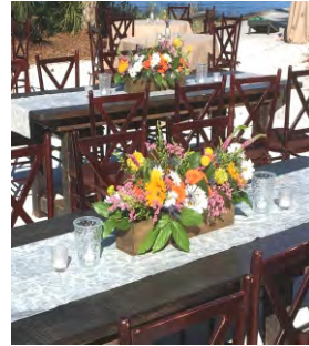
Rustic Flower Boxes: Available in 6'x6" and 6"x12"