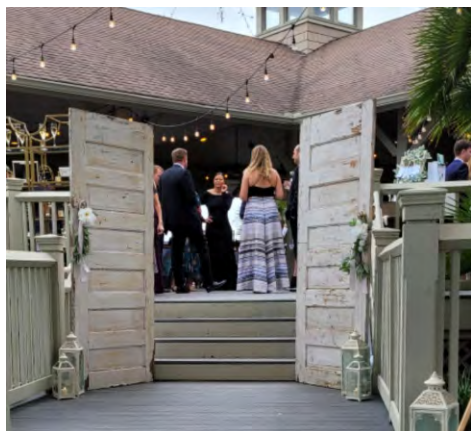
Rustic Door Entrance Arch: $450.00, plus $100.00 set up/$100.00 take down. (Floral not included)