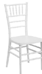
Chiavari Chair, White: $10.00 (+ $2.00 installation & dismantle)