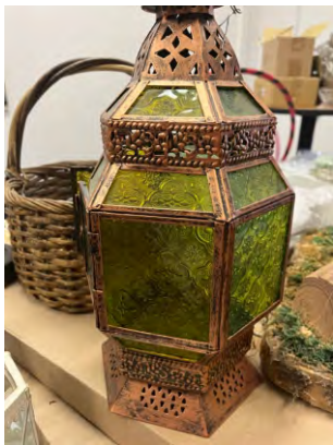
Ornate Copper Lantern