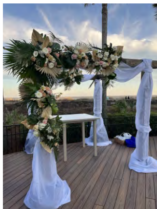
Double 8' Distressed Wood Rodeo Arch: $450.00, plus $250.00 set up/$150.00 take down