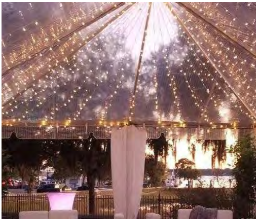
Tivoli (tiny bulb) Lighting: $1.50/running ft.