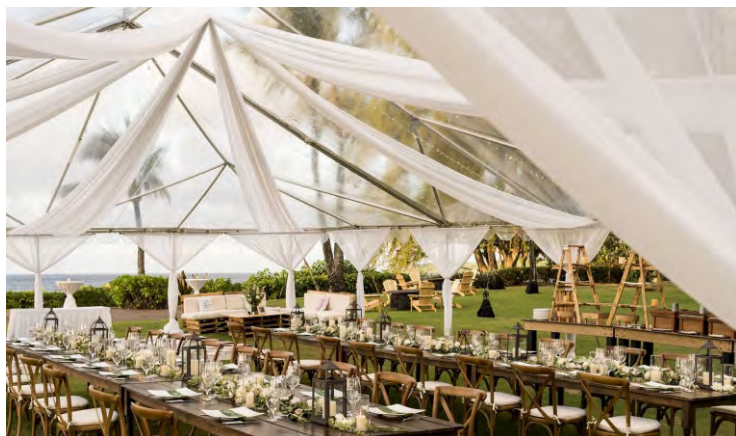
Ceiling Drape: $3.00 per running ft., plus labor (Discounts available based on total quantity)