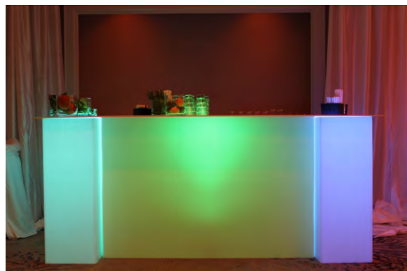
8' Wide, Illuminated Bar Surround, including LED lights (Branding/Color Options Available): $350.00