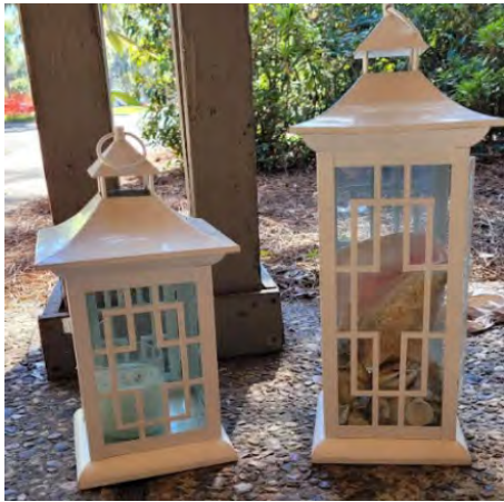
White Lantern, Small: $10.00/each (3 Available) | White Lantern, Large: $20.00/each (2 Available)