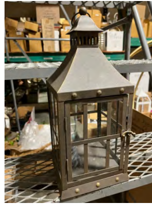
Pewter Metal Lanterns