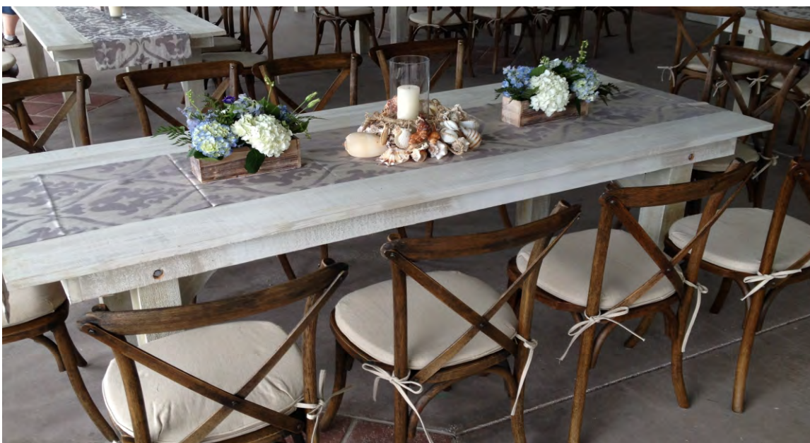
40" x 96" White Farm Table (benches and chairs additional): $150.00