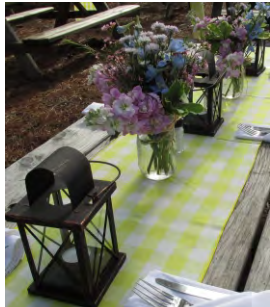
Distressed Copper Lanterns: $6.00 ea.