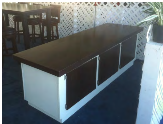
30" x 30" x 96" Mahogany and White Buffet with Under-Cabinet Storage: $240.00