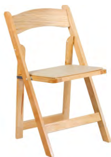
Padded Folding, Natural: $4.50 (+$2.00 installation)