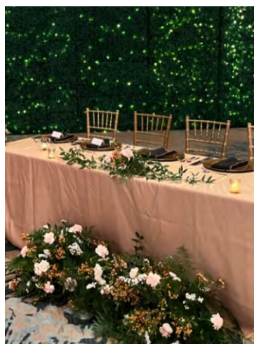
4' x 8' Sections of Lighted Boxwood Wall: $200 | Fairy Lit, add $25.00. 10 panels available for up to 40'