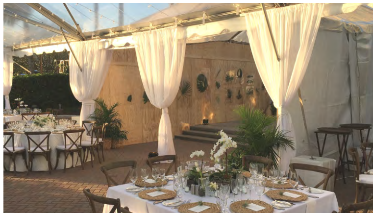
Fabric Pull Downs: $150.00 ea., plus labor