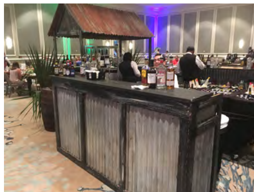
Corrugated Bar: $250.00