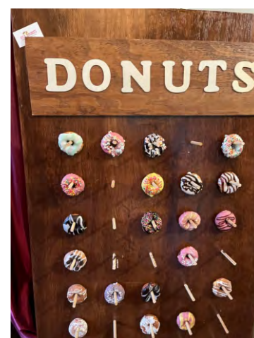
4' x 8' Donut all: 6' Tall. Fits 50 Donuts. (Must be placed on floor): $150.00