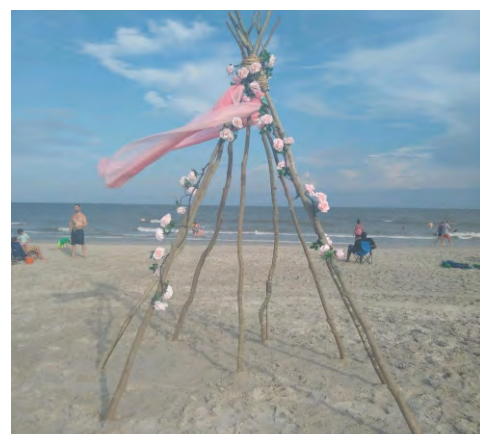
Bohemian Arbor: $750.00, plus $200.00 set up/$150.00 take down. (Floral additional)