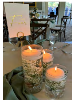
Set of 3 Floating Candles : $3.00 ea.