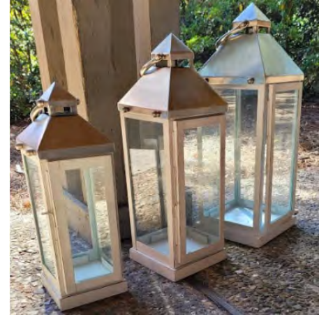
Silver and White Lanterns in 3 Sizes; 4 of each available. Small: $10.00/each | Medium: $20.00/each