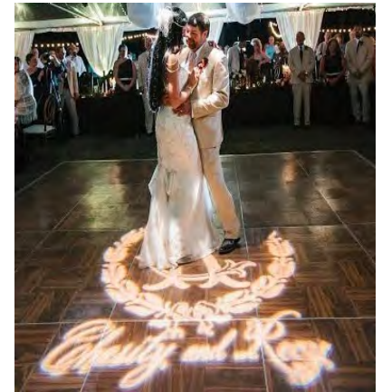
Custom Gobos w/ Leko Lights: TBD