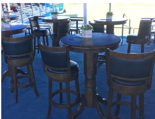
Black Leather w/ Cappuccino Swivel Bar Stool: $50.00