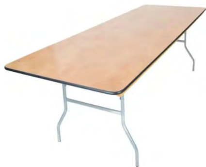
6' x 30" x 30" Banquet Table: $12.00