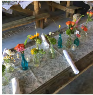
Assorted Vintage Vases: $2-5.00 ea.