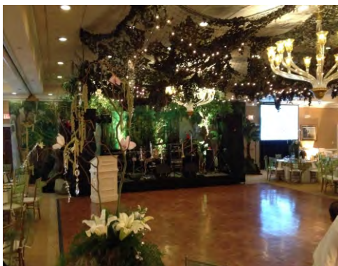
Natural Wood, Snap-lock Dance Floor (Fits 1' x 1' tiles / 3 square-foot lock).