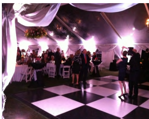
Black and White Check: $3 per square foot