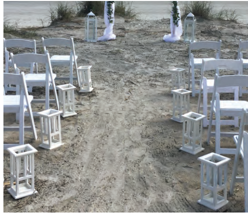
Wood Lanterns: $15.00 w/cylindrical candle or sand and sea shells