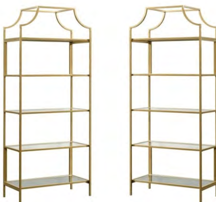
4' x 8' Gold Metal Bookshelves with Glass Shelves. 2 Available: $200.00 ea.