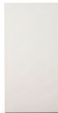
4' x 8' Sections of White Wall: $125.00