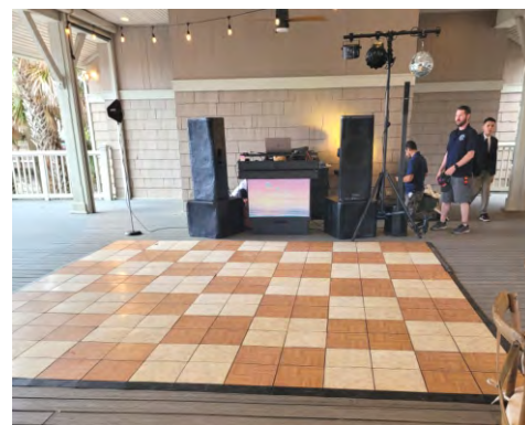
Natural Wood and White Check

* Outdoor Requires Subfoot at $1.50 per square foot