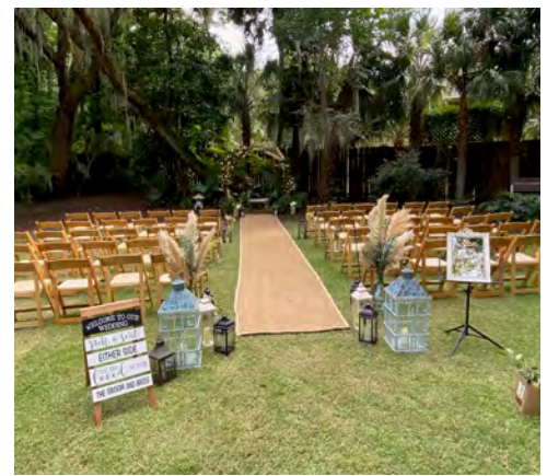
Sisal Aisle Runner: $200.00