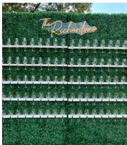
4' x 8' Sections of Boxwood Wall: $150.00 per section. (6 sections available to rent). Option for shelving - add $75/section. Clear acrylic for champagne flutes: $75.00. $100.00 set up/$100.00 take down. Add $75.00 to hang neon sign.