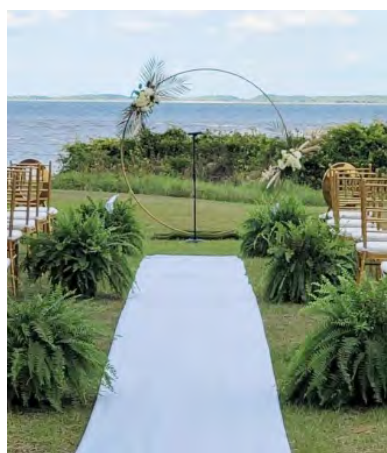
6.5' Circular Gold Arch: $200.00, plus set up and take down, TBD