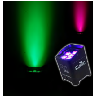
DJ Freedom Par Tri 6 Wireless Rechargeable Uplight Wash LED Light: $35.00