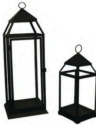
Matte Black Metal Lanterns 14":$7.50-10.00 ea. w/Candle