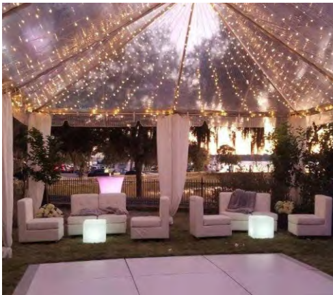
Modernline Furniture: Straight Back, Armless (18): $100.00 Corner Section with Arms (2): $120.00 Glass Coffee Tables: $75.00 ea. Glass End Tables: $50.00 ea.