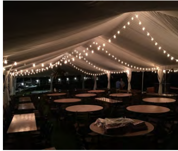
Café Lights: $2.00/ running ft.