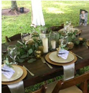
Assorted Pillars in 12" Cylindrical Vases with Floating Candle: $10.00 ea.