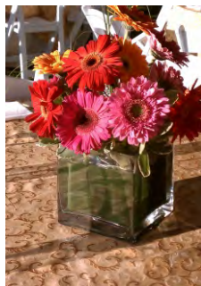
Square 4" Glass Vases: $3-5.00 ea.