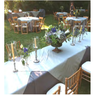
Assorted Candlesticks: $3.00 ea.