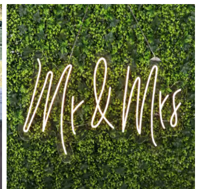
Warm White Mr. & Mrs. Neon Sign: $100.00