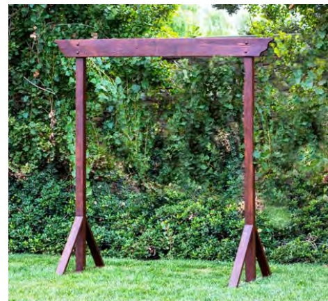
8' x 8' Dark Wood Rodeo Arch: $255.00, plus $150.00 set up/$100.00 take down