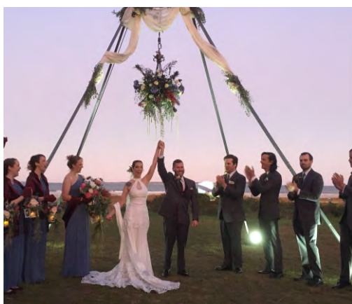
A-Frame Ceremony Arbor: $750.00, plus $300.00 set up/$150.00 take down. (Floral and fabric additional)