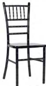
Chiavari Chair: Black: $10.00 (+ $2.00 installation & dismantle)