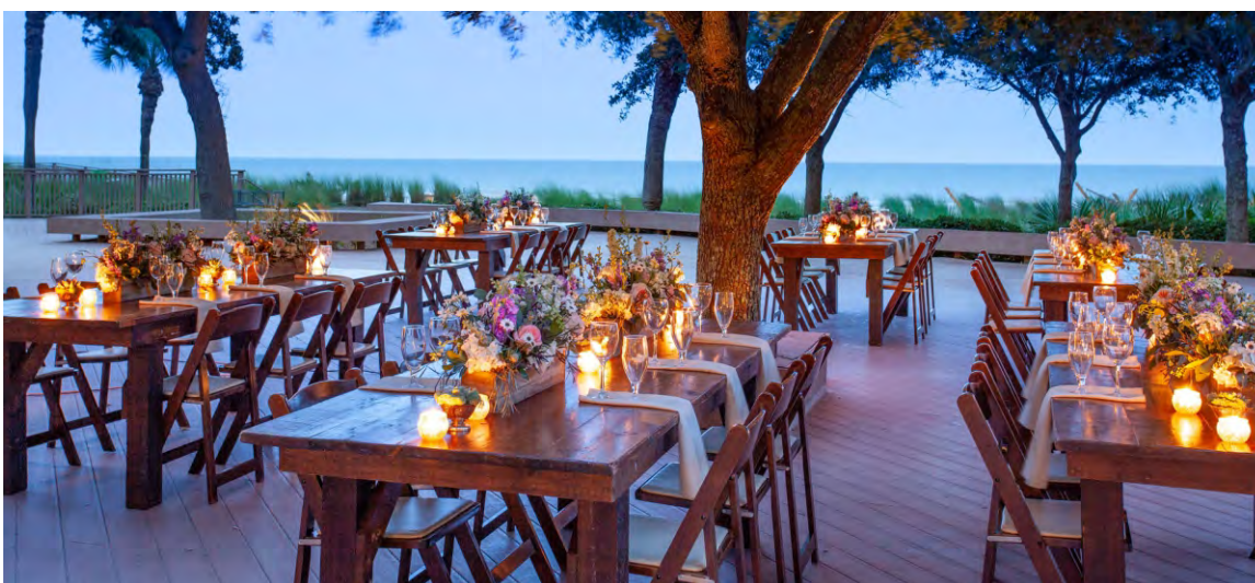
40" x 96" Americana Brown Farm Table (benches and chairs additional): $150.00