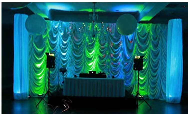
Illuminated Columns: $150.00 ea., plus labor