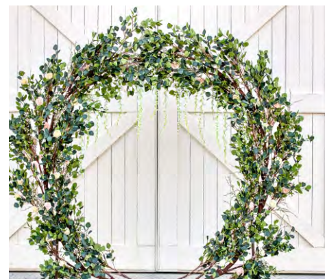
Real-Touch Eucalyptus, Circular Arch: $375.00, plus $200.00 set up/$100.00 take down. (Greenery is included. Floral additional)