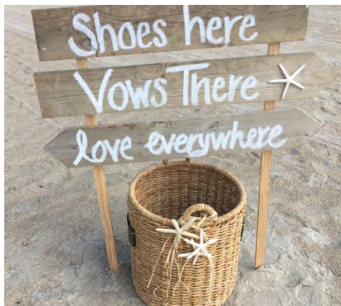
Sign & Basket:$75.00 ea.