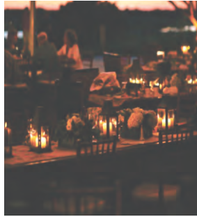
Iron Table Lanterns: $6.00 ea.