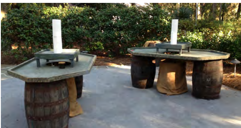
Oyster Shucking Table: $250.00 (2 Barrels & Oyster Top)