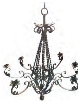
Wrought Iron Chandelier: $250.00 (Candles by florist)