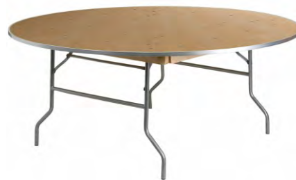
72" Round Banquet Table: $18.00