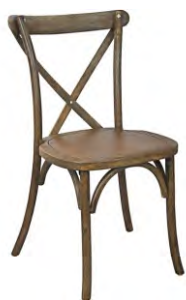
X-Back Chair: $11.00 (+ $2.00 installation & dismantle)