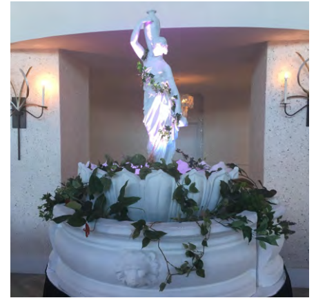
Water Bearer Fountain: $1250.00, plus labor. (Floral Additional)