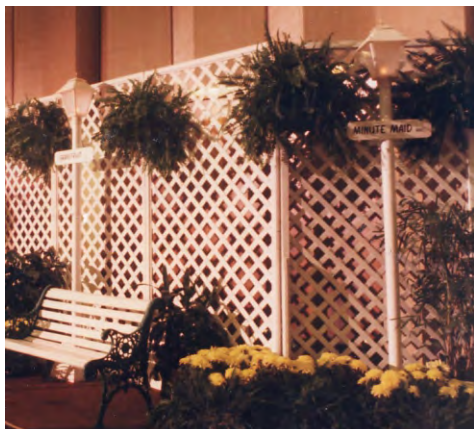
Indoor Lattice Panels: $50.00 ea. Outdoor Lattice Panels: $75.00 ea.