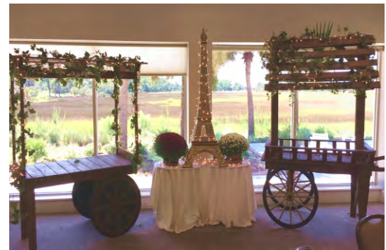
Market Cart (3' x 7' Surface): $250.00 (3 styles available)