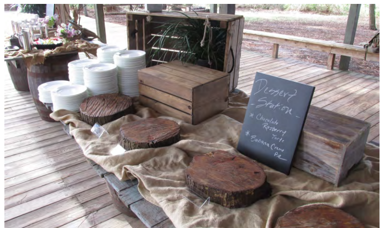
8' Rustic Wood Plank Buffet: $150.00 ea.