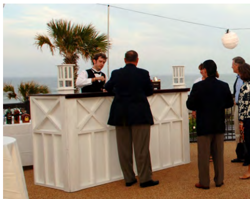
8' Crosshatch Bars & Surrounds: $300.00