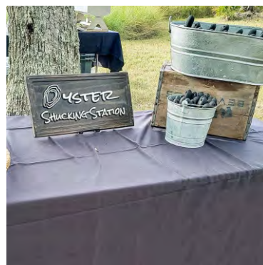
Custom Vinyl/Sandblasting Signage