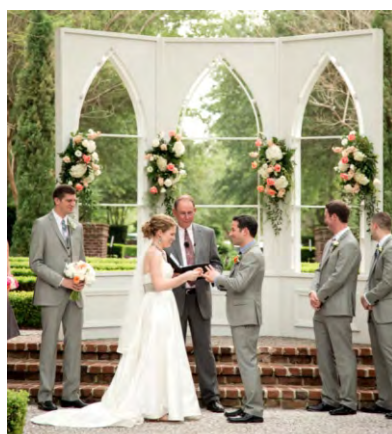
Southern $200.00 per panel, plus $200.00 set up/$100.00 take down. (Floral additional)