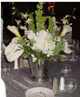
Silver Buckets: $5.00 ea.