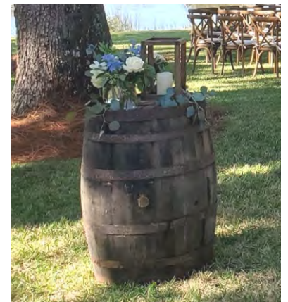
Whiskey Barrels: $75.00 ea. Wine Barrels: $90.00 ea.