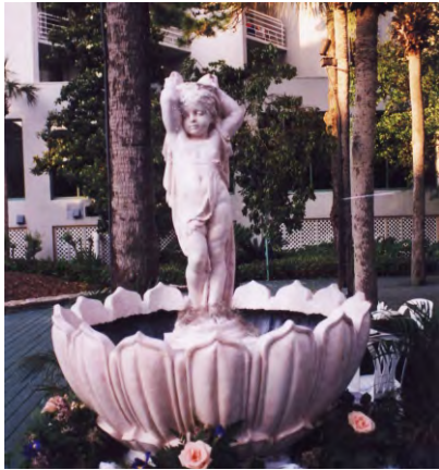
Cherub and Lotus Fountains: $450.00, plus labor.