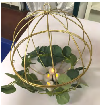
Gold Wire Chandelier