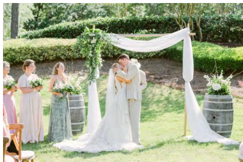
Bamboo Arbor, Single: $200.00, plus $200.00 set up/$100.00 take down. Non Cascading Top Spray, Small: $175.00. Bottom Spray, Small: $100.00. With Fabric, add $75.00