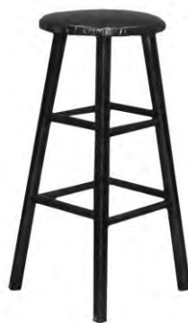
Black on Black, 29" Padded Bar Stool: $15.00