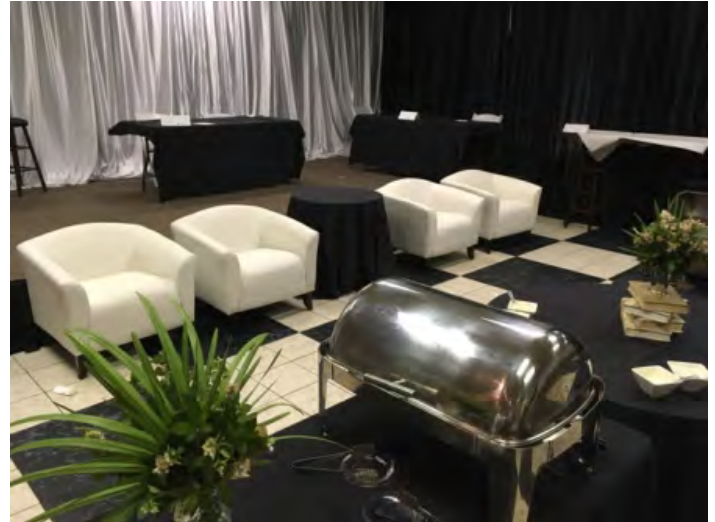
White Leather Arm Chairs: $75.00 ea.