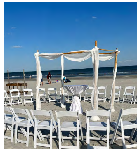
Bamboo Arbor, Double: $350.00, plus $200.00 set up/$150.00 take down. (Floral additional). With Fabric, add $150.00