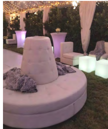
Round Couch: $375.00 (One available)