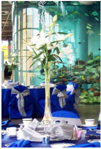
Eiffel Tower Vase: $7.50 ea.