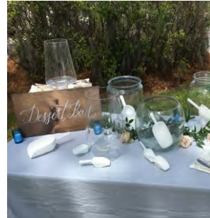
Serving Jars & Jugs: $5-7.50 ea.