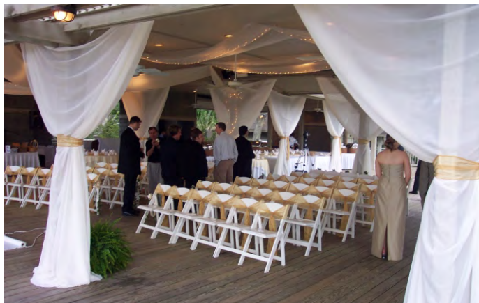
Fabric Treatments: 8'-Wide Organza Pulldowns $150.00 ea., plus labor