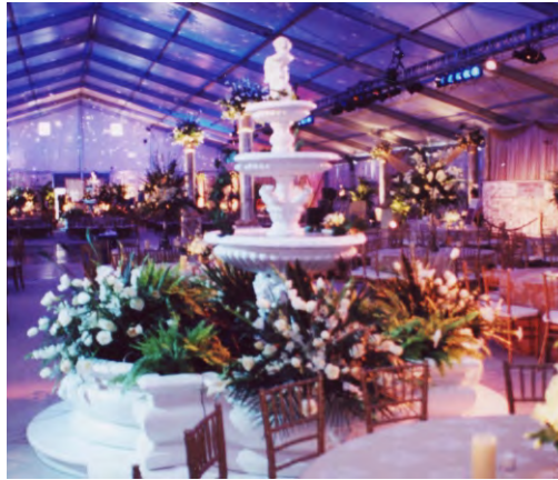
Large, 3-Tiered Fountain: $2250.00, plus labor. (Floral Additional)