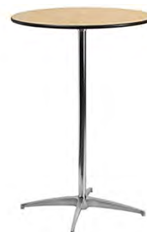
High Top Table: 40" Tall, 30" or 36" Diameter Cocktail: $14.00